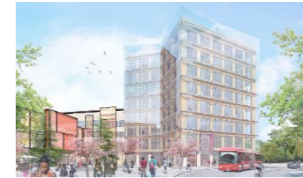
Danderyds Centrum Hus04 new office building nearby Mörby centrum